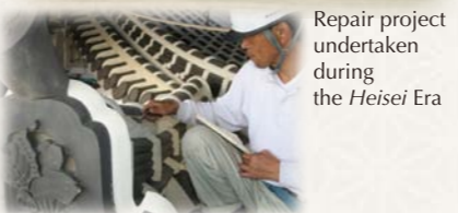
Repair project undertaken during the Heisei Era