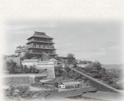
Major repair project undertaken during the Showa Era (around 1960)

Himeji Castle is characterized by its soaring majesty. Due to the similarity of its overwhelming ambience to a white heron taking flight, it is also known as the White Heron Castle. Because the structure is made of wood, it requires periodic repair and restoration. A five-year project was recently undertaken to preserve the Main Keep, and ensure that this invaluable World Heritage and National Treasure can be passed on to future generations with its beauty intact. As part of it, the structure's plaster walls were resurfaced, and its roof tiles were replaced, for the first time in 50 years. The completion of this work was celebrated with a grand reopening in March, 2015. Don't miss this chance to gaze at Himeji Castle, now that its blazing white brilliance has been restored.